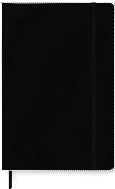
2. FRONT PD