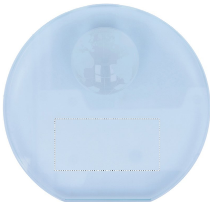
3. BACK GLASS