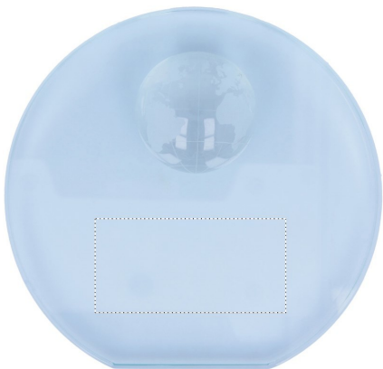
2. FRONT GLASS