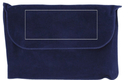
1. FRONT FOLDER