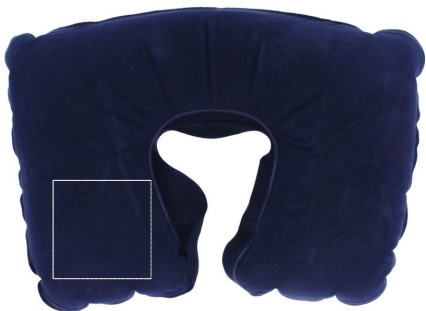
3. LEFT PILLOW