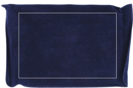
2. BACK FOLDER